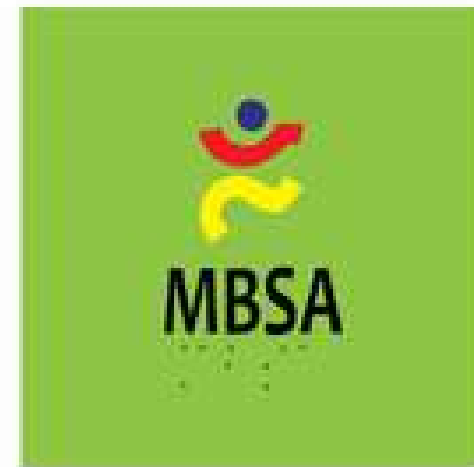
Malaysian Blind Sports Association